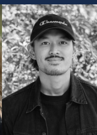
KOA HO BASSIST